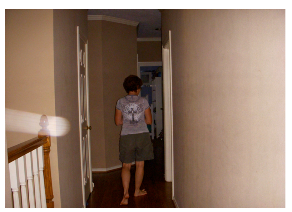
Image 1: Below is a bright "orb" caught on camera by my daughter, Michelle, who decided to take pictures when she felt her brother's presence a few days after Erik's passing. The "comet's tail" implies movement, so we had it analyzed by photography expert, Rahasya Poe. In the

second photo (image 2), the gamma is reduced, revealing that the orb is it's own light source, which casts light on nearby structures.